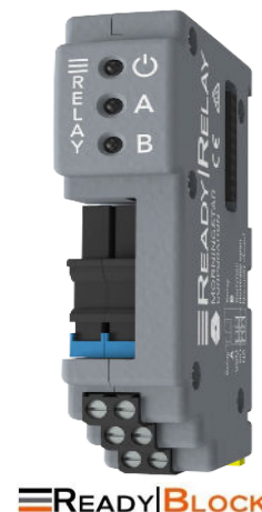
ReadyRelay block, part of the ReadyRail expansion system