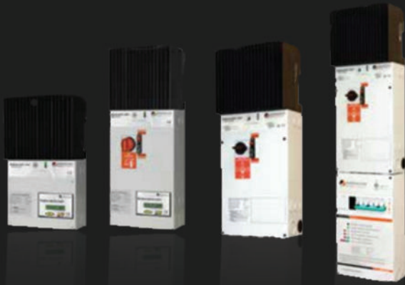
Standard, DB, TR, and TR with GFDP versions shown with optional display meters